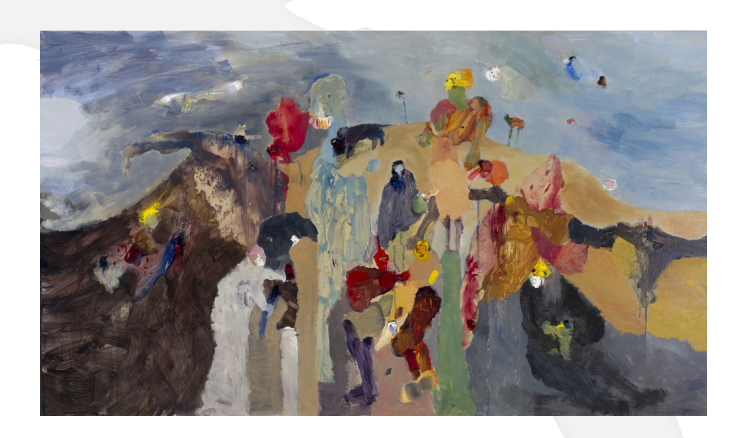
Karen Black 'Loaded Gun' 2012

Mild cheeses. seared duck breast, light roast meat.